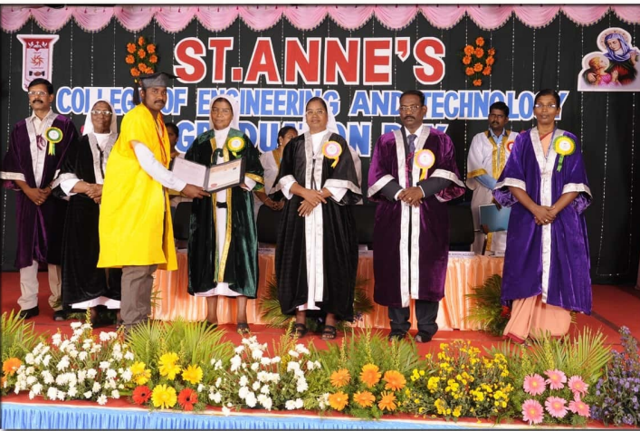
4 th Graduation Day