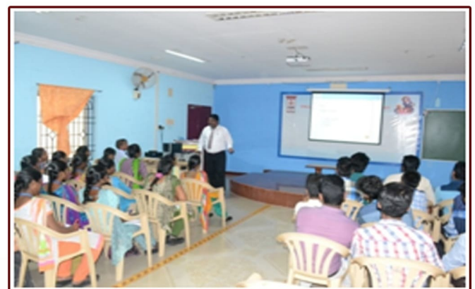
“Hardware and Servicing”