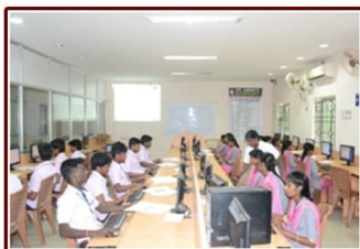
Programming on PHP