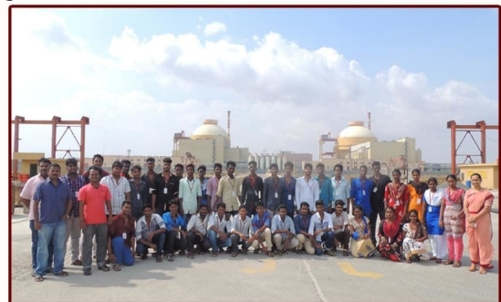
“Koodankulam Nuclear Power Plant”