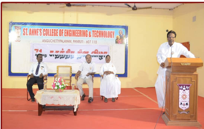
71 st Independence Day