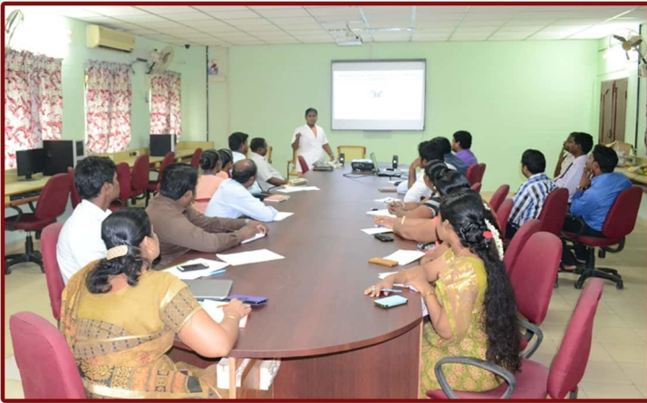
FDP on LATEX