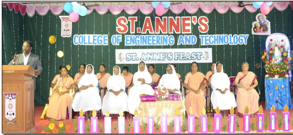
St.Anne's Feast Celebration