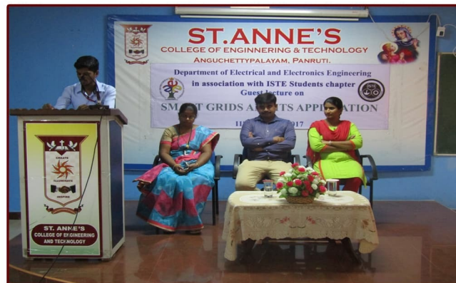
“Smart Grid And Its Applications”