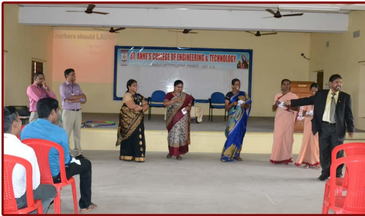
Staff Orientation Programme