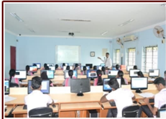
Core Java and Programming