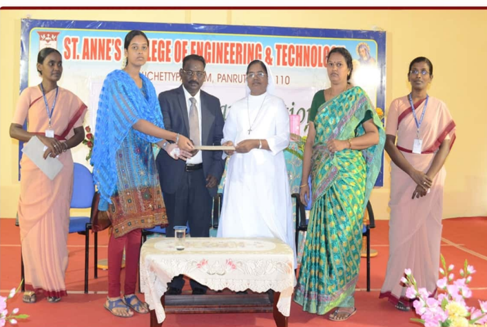
First Year Inaugural