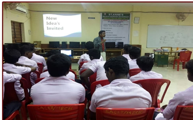
“PROJECT – AN OVERVIEW”