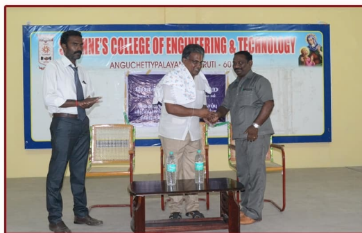
"Road Safety awareness program"